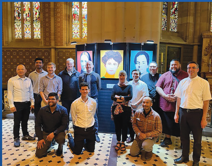
1st year Seminarians at the Great Women of Faith Exhibition at St Patrick's Cathedral Melbourne

The Archbishop's Dinner is held each year to raise money for the Priests Support and Education Fund.