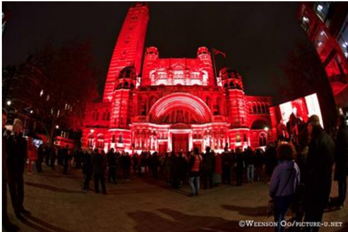
Westminster Cathedral lit up red on #RedWednesday 2016.

Please do join in solidarity on #RedWednesday (November 24th) with all the people around the world who suffer as a result of their faith.