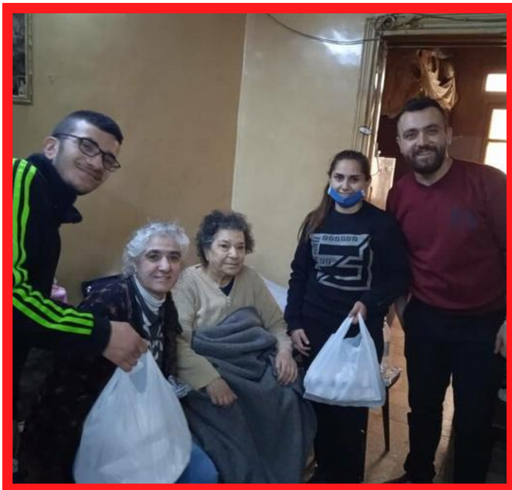
Recipients of the 'Meals on Wheels' project in Aleppo, Syria, supported by ACN.

The high and rising costs of rent, medicine and food have left many households unable to cover their basic costs. Now nine out of ten Syrians do not have enough money to buy the food and clothing they need and to pay for somewhere to live. The effect of the war on the local Christian community has been immense. Today Christians comprise around 3.6% of the Syrian population, down from 10% before 2011.