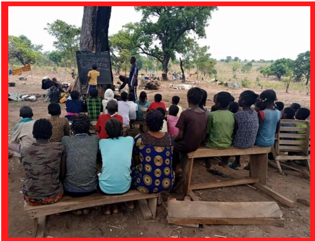
IDPs learning under trees at Ukpiam, Guma Lga of Benue.

Despite this, many stand strong in their faith.