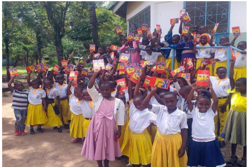
Children in the Diocese of Musoma, Tanzania, receive copies of 'God Speaks to His Children', the ACN Child's Bible.

Pray together: x1 Our Father, x1 Hail Mary, x1 Glory Be and add any personal intentions.