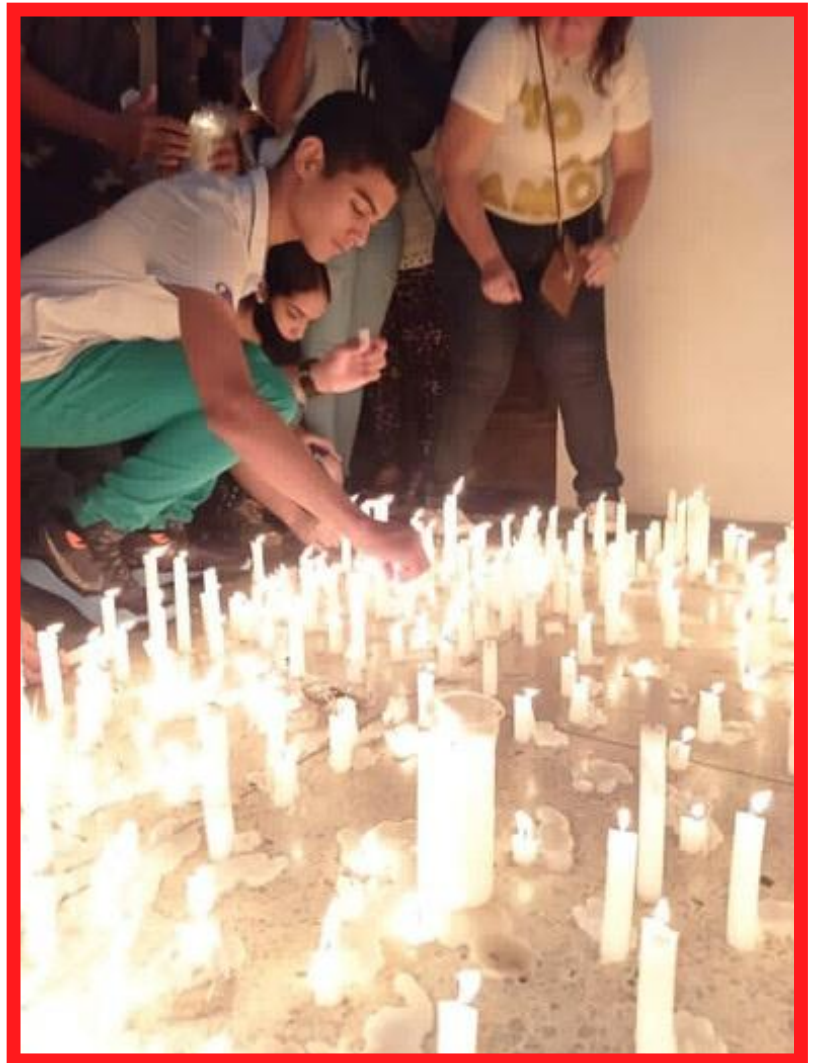
People lighting candles for the deceased in Venezuela.