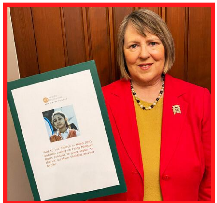
Fiona Bruce, MP, holding the petition from ACN.