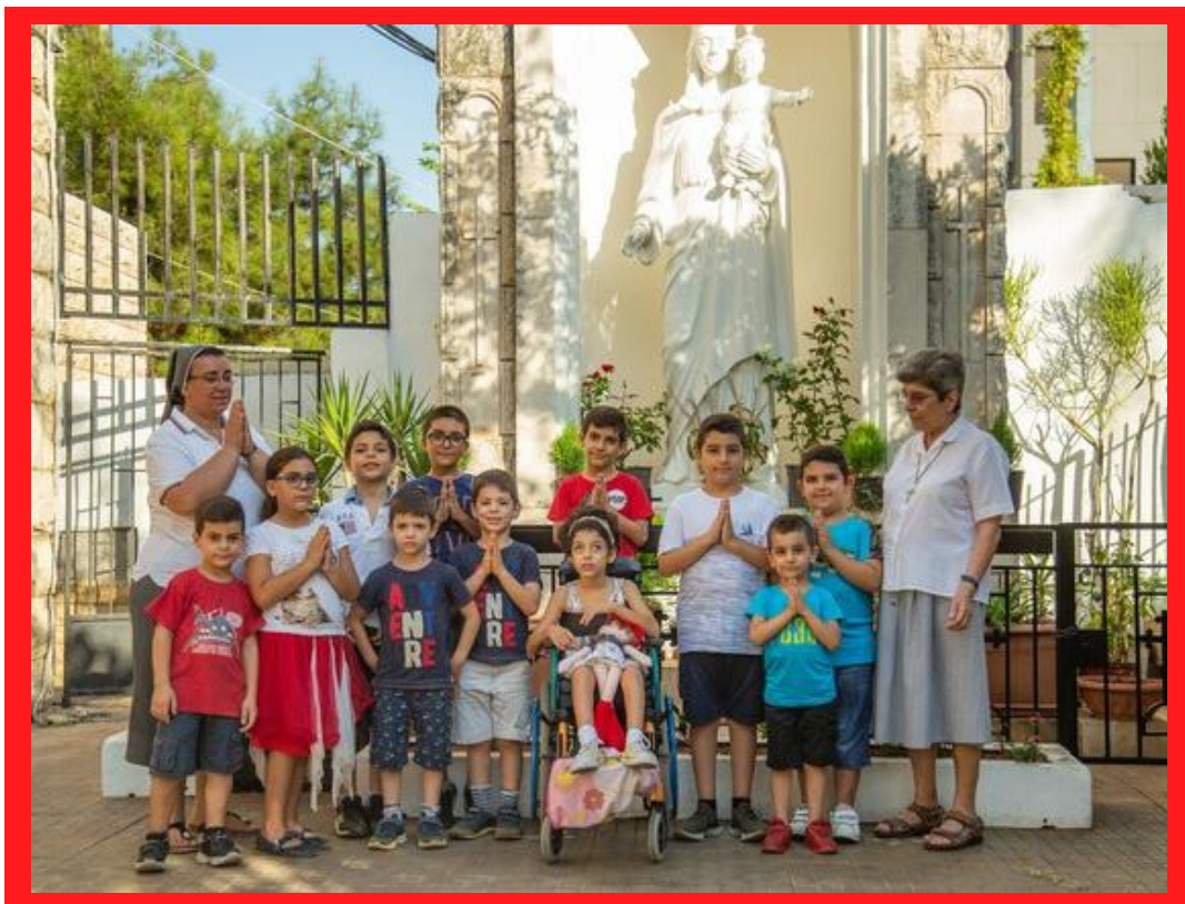
The Sisters of the congregation of Jesus & Mary are helping Christian families in Beirut and will be giving a Christmas surprise to some of these children, whose parents are struggling otherwise due to the economic collapse.

The value of their currency has plummeted drastically, meaning that simply getting hold of the necessities of day-to-day life has become incredibly expensive. This, coupled with the Covid-19 pandemic and a huge explosion which destroyed part of the city of Beirut, has made life very difficult for the people of Lebanon.