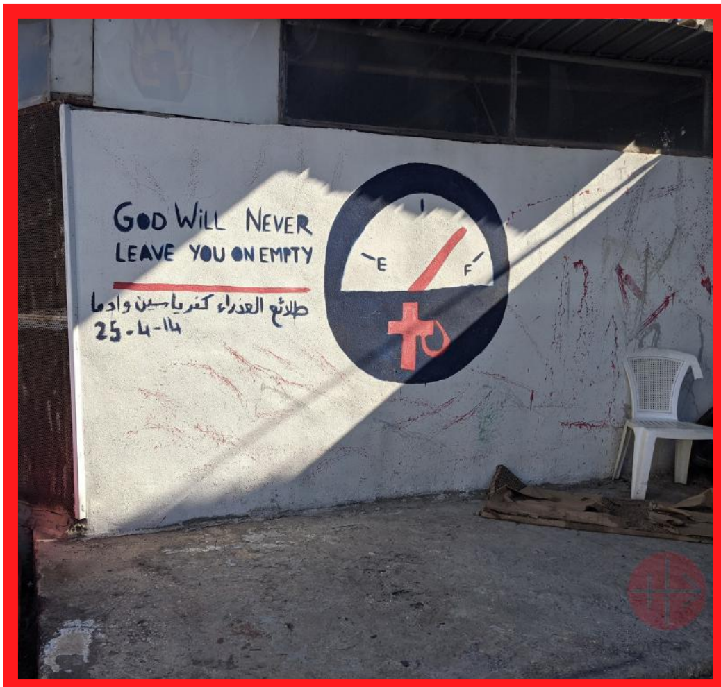
A mural on a wall in Beirut, Lebanon, with the message "God will never leave you on empty".

We pray especially for those who live in places where they may be hurt or killed for their religious beliefs. As we get closer to #RedWednesday, we pray for the strength and courage to speak up for those who are discriminated against for their faith.