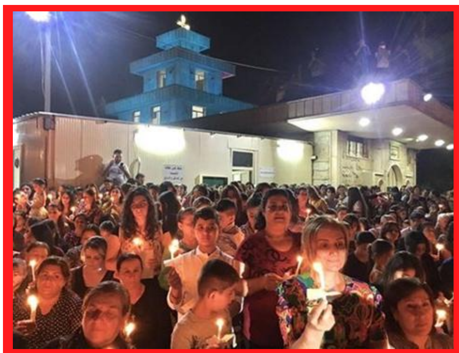
Christians celebrating and praying after the liberation of Qaraqosh, Iraq.