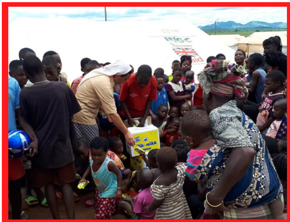
Victims of the violence in Cabo Delgado at a camp for displaced people in Lichinga, in the province of Niassa.

"They are people with nothing, who depend entirely on solidarity. They're empty-handed people".