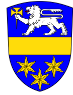
CATHOLIC DIOCESE OF SALE