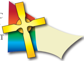
CATHOLIC DIOCESE of BALLARAT