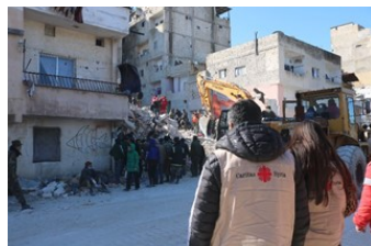
Left: The destroyed Cathedral of Iskenderun.