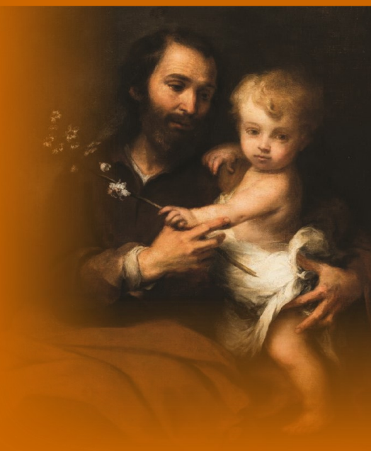
Image: Saint Joseph and the Christ by Bartolomé Esteban Murillo (1617–1682)

St Joseph, man of dreams and trusting steward, pray for us.