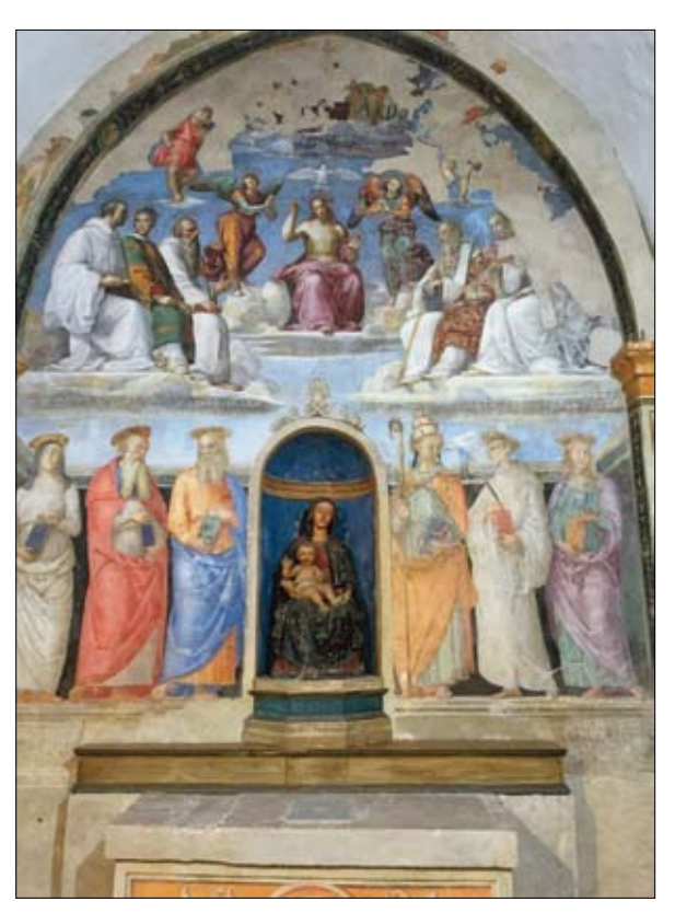
Fresco in St Saviours Chapel close to the Perugia Archdiocesan Archive 2018. The top half is by Raphael and the bottom half is by Perugino.