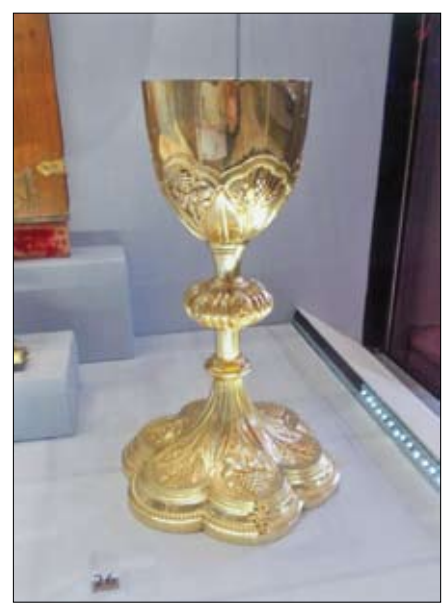
Ordination chalice of James Goold 1835 Displayed in the Victoria & Albert Museum London 2016

Perhaps, in London, it is in a natural context. Certainly, it's a great honour for it to be in such a prestigious Collection as that of the V&A, as long as it is displayed clearly as having been the ordination chalice of the first Catholic Bishop of Melbourne. This was a man who deserves recognition for his foundation of the Victorian Church and for his fine eye for religious art and buildings. Goold's Collection survives relatively intact and will be honoured in 2019 with a book from Melbourne University Press and an exhibition at the Treasury Museum