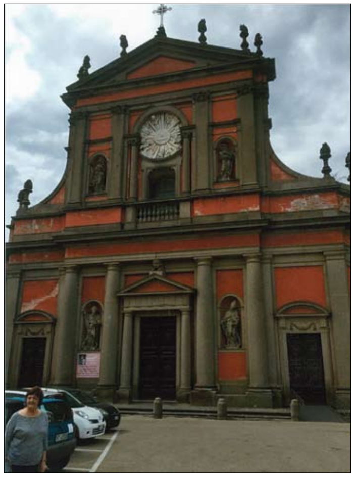
The Church of the Augustinian Monastery Viterbo 2018