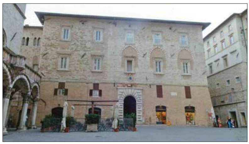
Archbishop's Palace in Perugia 2018

The Cathedral of San Lorenzo was a magnificent building in the Baroque style. Jaynie's comment as we entered was most appropriate, 'So this is what Goold was attempting to replicate in Melbourne.'