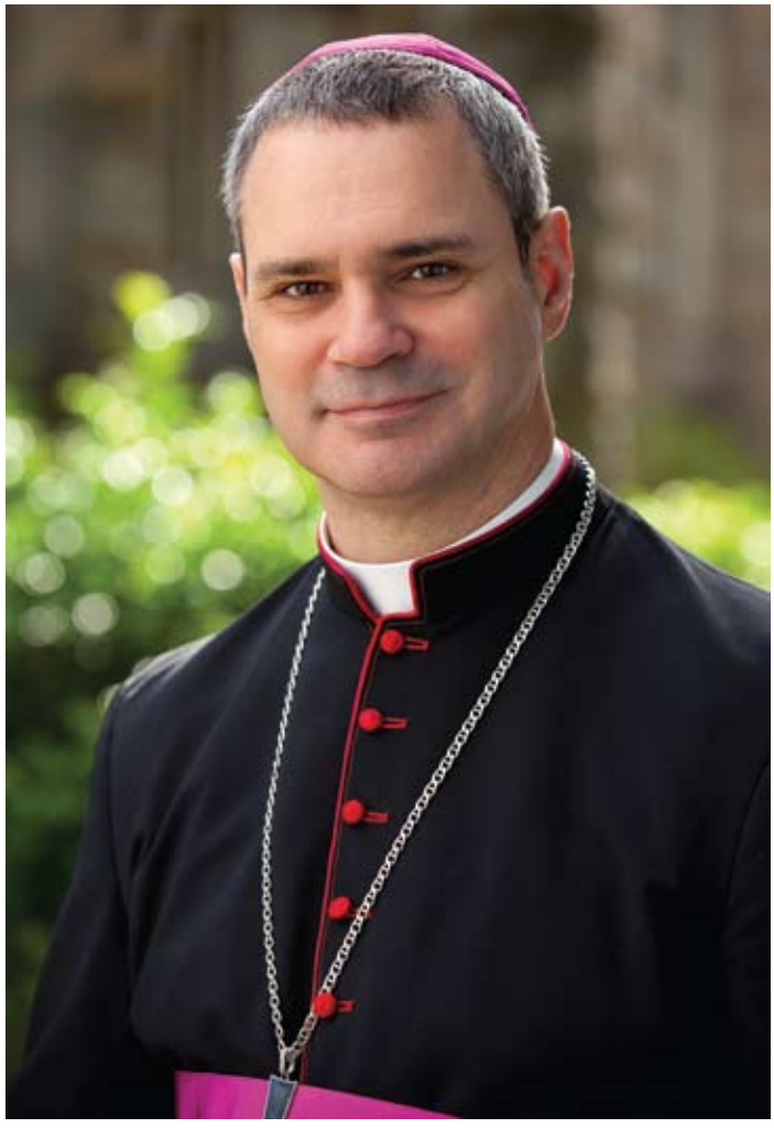
Peter Comensoli 2018 9th Archbishop of Melbourne