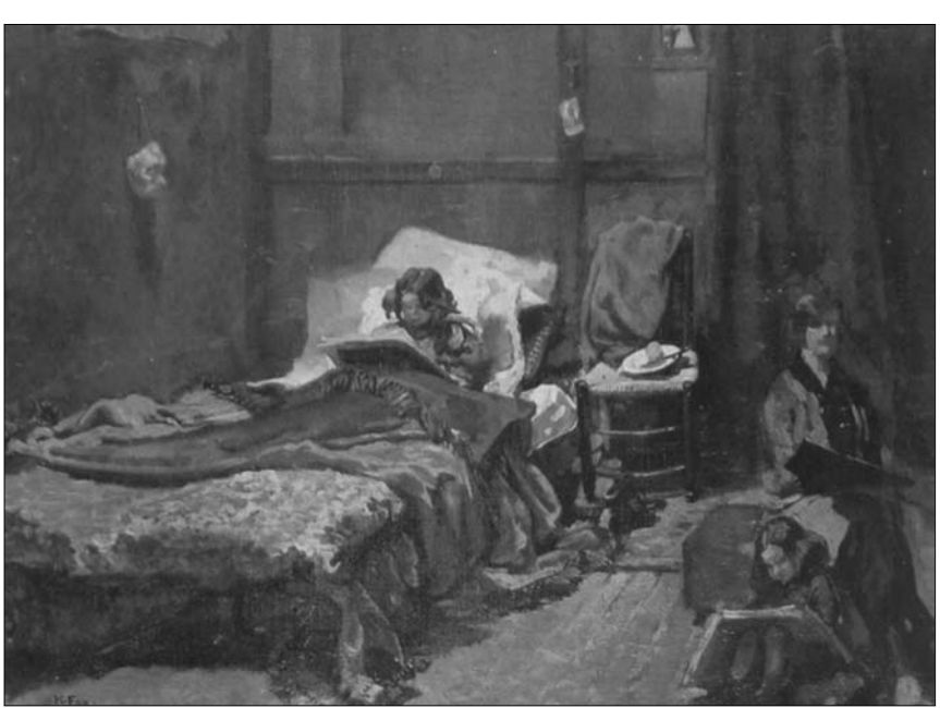
(Below): Those of Yesterday